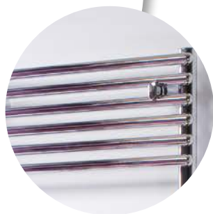
Large towel rails